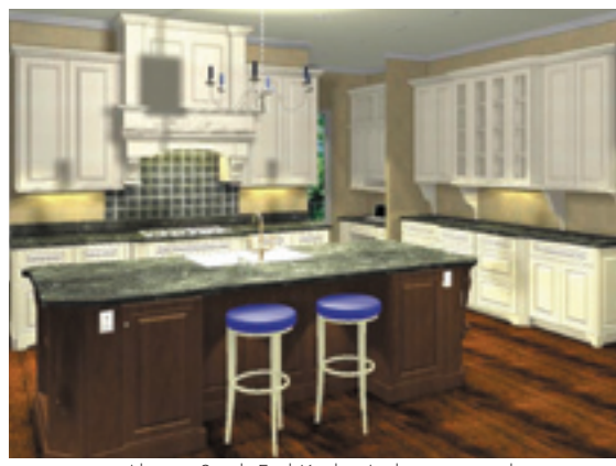
Above: South End Kitchen's design consultants create computer-aided, rendered drawings like the one shown above to help clients envision their completed space.

Right: This elegant kitchen features custom cabinetry in two finishes, specialized cabinets that meet the homeowner's storage needs, and extensive trim pieces that combine to create a unique style.